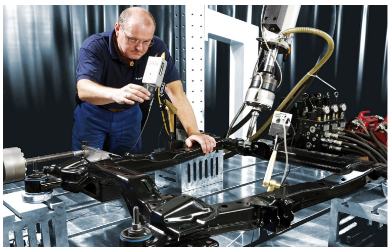
Figure 1: KIRCHHOFF Automotive has high technology standards

In this age of digitalization, a functioning IT infrastructure naturally plays a central role. That's why in 2018 the IT team decided to implement Checkmk for its IT monitoring. Previously, KIRCHHOFF Automotive used Icinga, openITCOCKPIT and Nagios, but none of these solutions were convincing in the long term, as the effort required to operate them was too great. The IT team wanted a tool that would meet the requirements of a large company with a global IT infrastructure.