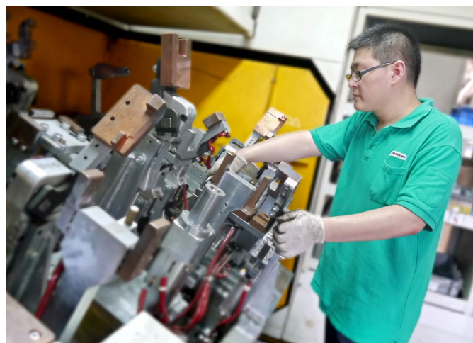
Figure 3: Among other things, Checkmk monitors IT systems in China

Like other companies in the automotive industry, KIRCHHOFF Automotive has to comply with the TISAX (Trusted Information Security Assessment Exchange) security standard. Since Checkmk has a very secure architecture and also supports security mechanisms such as encryption, obtaining certification was no problem. The customization of Checkmk was minimal and well-documented. This is important because the IT team has to prepare an assessment report for TISAX.